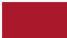
PLAST ROSSO RUBINO PLAST RUBY RED