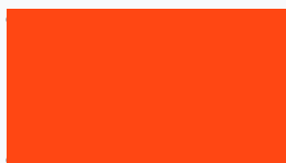
PLAST ARANCIO PLAST ORANGE