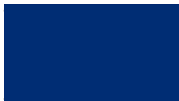
PLAST BLU PK PLAST BLUE PK