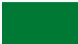
PLAST VERDE EXTRA PLAST GREEN EXTRA