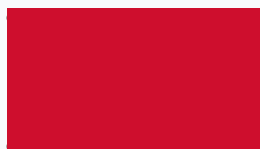
PLAST ROSSO VIVO PLAST BRIGHT RED