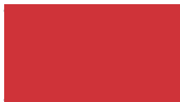
PLAST ROSSO PK PLAST RED PK